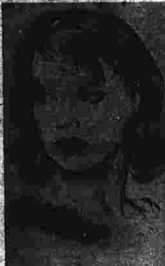
Anne Francis stars as "Honey West" Friday evenings at 9 on ABC.