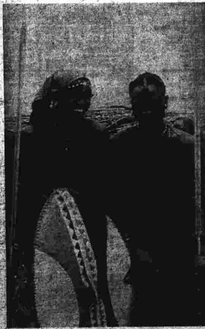
ABC's "Discovery '65" visits Masai warriors as it explores modern life in Kenya Sunday morning at 11:30.