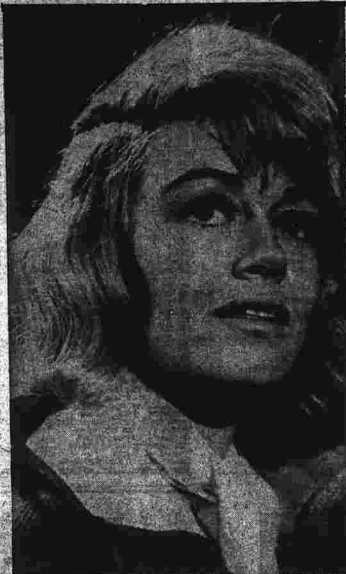
Dorothy Malone, recovered from an illness that nearly cost her life, returns to "Peyton Place" Tuesday. Miss Malone portrays Constance Mackenzie on the series.