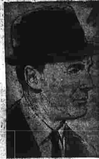
Steve Forrest plays John Mannering on "The Baron," beginning Jan. 20 at 10 on ABC.